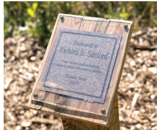
The Dedication Plaque along the Children's Trail

So, if you like to cycle, walk, jog or just enjoy a beautiful setting, make sure to go and explore the newest trail along a ridge on the east side of the Cheboygan River.