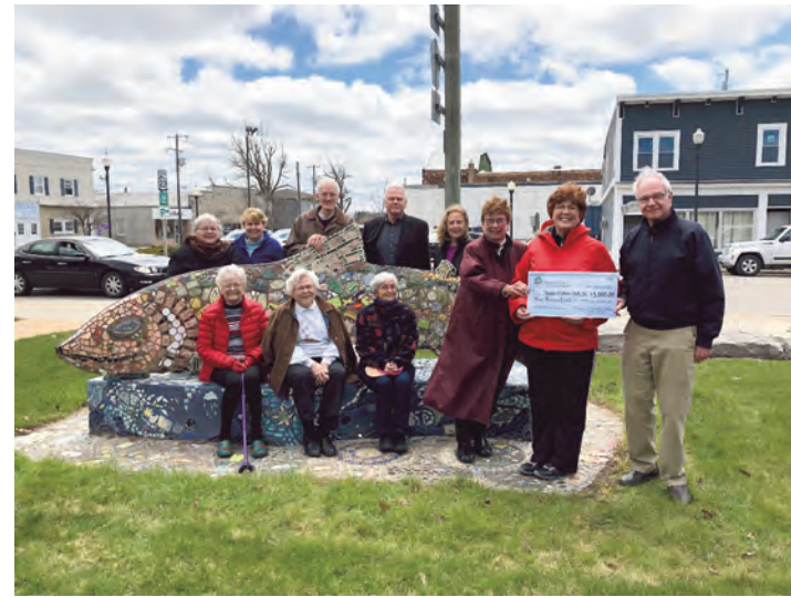
The Friends of Ottawa Park, Inc. Receive a $3,000 Grant from the Cheboygan County Community Foundation.

As another fall and winter approach us, it is once again time to ask for your help. The Cheboygan County Community Foundation is and has been a very unique member of the community foundation family. While most community foundations are primarily dedicated to social service issues and arts and entertainment, the Cheboygan County Community Foundation was founded to address a different need. This county needed new businesses, stronger businesses, and more jobs. The Cheboygan Foundation was created to help fill this need. Its primary aim is to further economic development and educational opportunities. As mentioned in our previous newsletter, the Cheboygan Foundation has done a great job in these two areas. We are limited only by our financial resources. That is where you have been incredible.