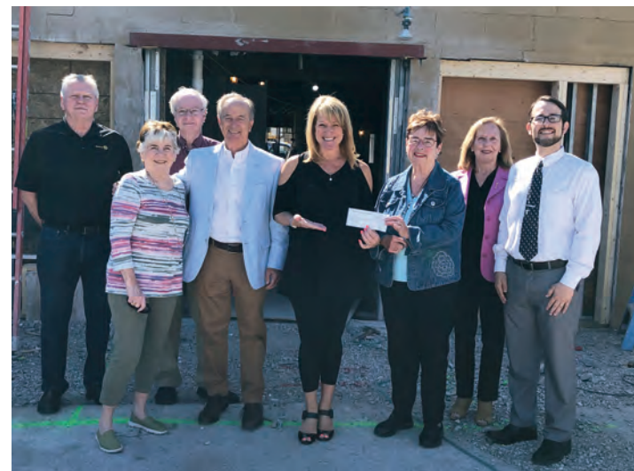
Cheboygan 221 Main Street Project Receives a $5,000 Grant from the Cheboygan County Community Foundation.